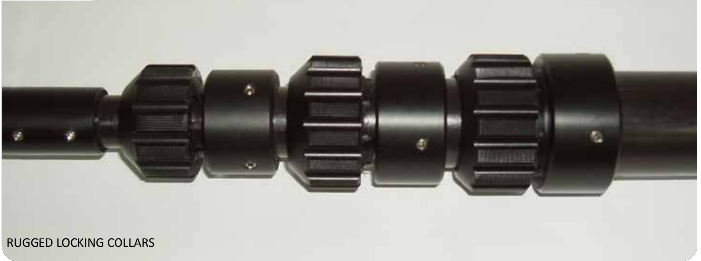
RUGGED LOCKING COLLARS