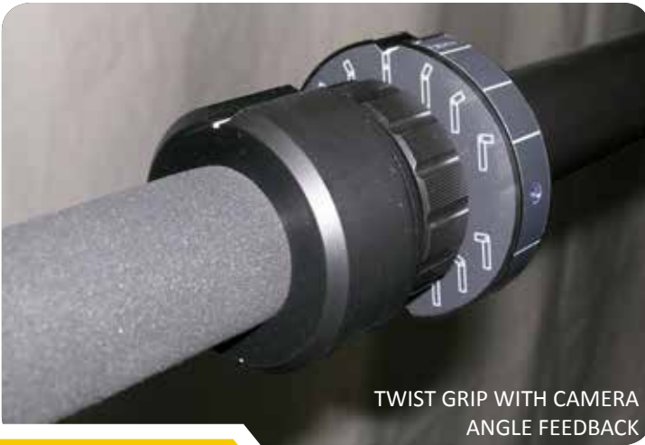
TWIST GRIP WITH CAMERA ANGLE FEEDBACK