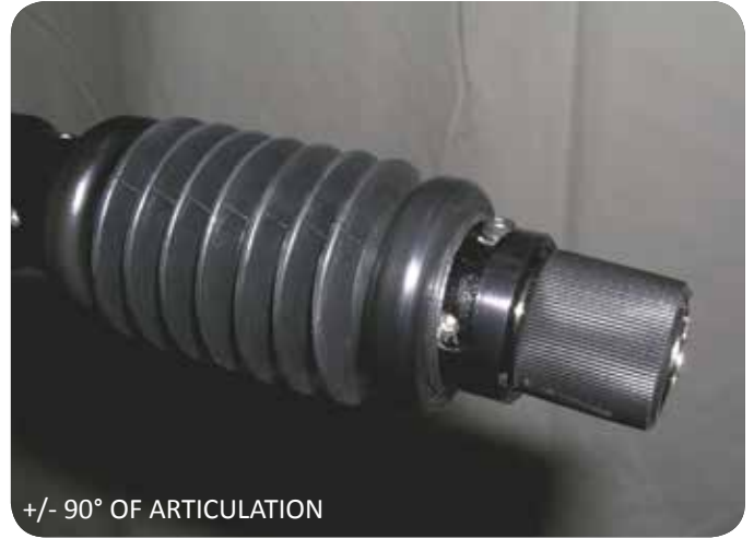
+/- 90° OF ARTICULATION