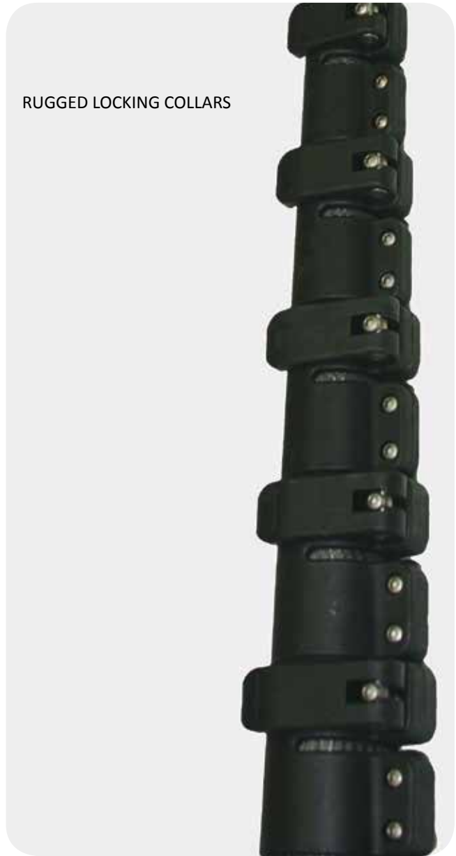
RUGGED LOCKING COLLARS