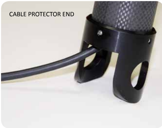
CABLE PROTECTOR END