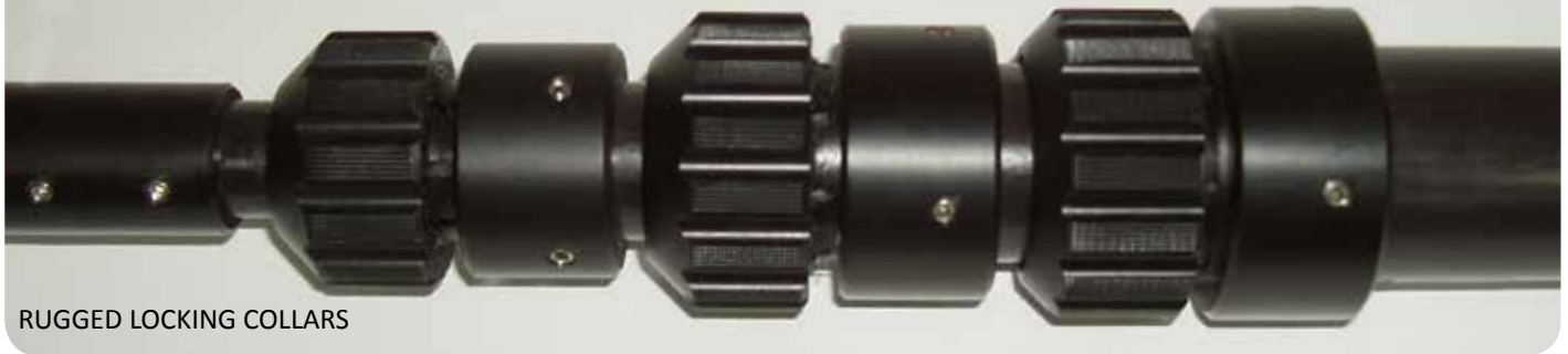
RUGGED LOCKING COLLARS