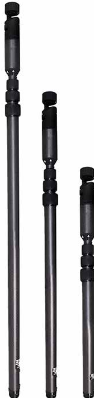
16FT, 10FT AND 6FT SYSTEM POLES SHOWN COLLAPSED