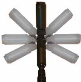
MOTORIZED HEAD HAS A +/- 120° RANGE (SHOWN WITH ULC-2.OIR-HD CAMERA)