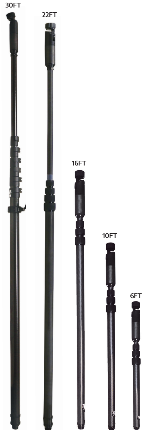
POLES SHOWN COLLAPSED