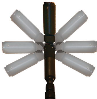
MOTORIZED HEAD HAS A +/- 120° RANGE (SHOWN WITH ULC-2.OIR-HD CAMERA)