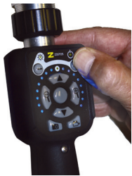
HD Handle with Integrated System Controls

line offers an array of field-swappable telescoping poles with flex-end or motorized 240° remote articulation camera mounts. The articulating camera enables the operator to conduct a thorough grid search of a