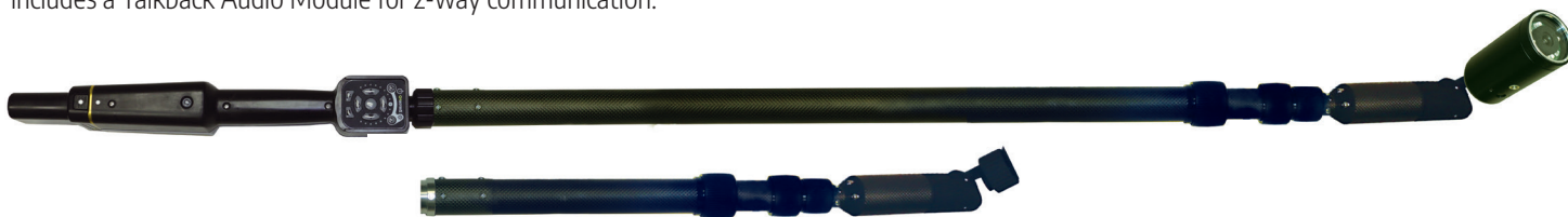
16' (5M) Motorized Pole & Universal Handle, 6' (2M) Motorized Pole, Wide Angle Color Camera

The Task Force HD System offers rescue teams a comprehensive selection of ZistosHD tools to work quickly and effectively in most search and rescue operations and conditions. The long 16' (5M) motorized pole allows for maximum reach and is useful for insertion into void spaces when on top of a rubble pile. The shorter 6' (2M) motorized pole telescopes down into a size (<4' or 1.2M) that makes it more manageable when crawling into a pancake or lean-to collapse. This system includes a Talkback Audio Module for 2-way communication.