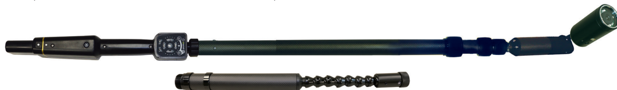
10' (3M) Motorized Pole & Universal Handle, 3' (.9M) Gooseneck Pole, Wide Angle Color Camera

The Discovery HD System further increases capability by increasing the motorized articulating pole length to 10' (3M) – less than 5' (1.5M) collapsed, for more capability in deep void spaces, and includes a 3' (.9M) gooseneck pole to cover initial site evaluation requirements with a lightweight, quick access solution. This system includes a Talkback Audio Module for 2-way communication.